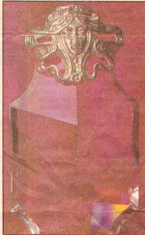
The witch's jewel . . . pendant designed by Vic Martine.